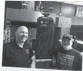
Steamboat BBQ in Wheaton

We are grateful to Steamboat BBQ in Wheaton for their amazing support of Bridge Communities. Not only did they serve as King of the Stage sponsor for the Glen Ellyn Backyard BBQ, they also hosted our volunteer appreciation luncheon, held a "whole hog" prep class to benefit Bridge and donated a catered party to the BBQ's raffle!