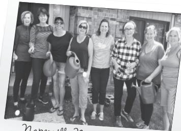
Naperville Newcomers and Neighbors Club