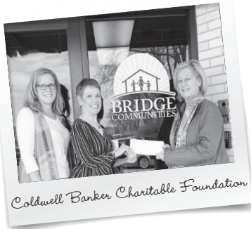
Coldwell Banker Charitable Foundation

Friends in the community like you are changing lives for Bridge families each and every day. Thank you for your outstanding support!