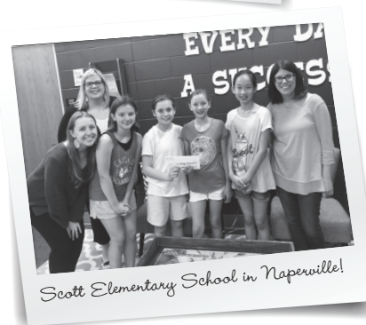
Scott Elementary School in Naperville!

Thank you to the students of Scott Elementary School in Naperville! Students made & sold bookmarks and bracelets over their spring break to benefit Bridge families—and ended up raising $170.25! That's enough for 5 nights of housing for a homeless family in need.