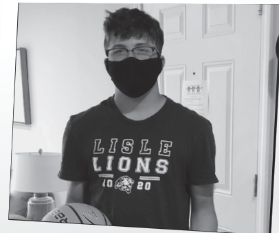
Thank you to The Driskill Foundation